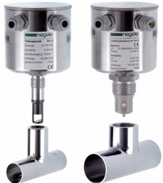
Sensors for phase separation. left the turbidity measuring unit itm-2; right the conductivity measuring unit ilm-2. Both aseptic weld-in tube type EHG.

=> minimal product losses; no quality differences; maximum safety and reliability; no personnel requirement